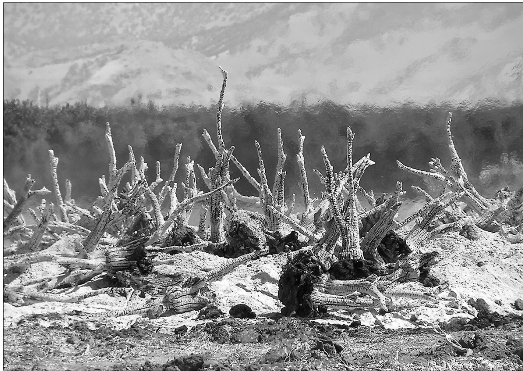
Orange Ash , photograph by James Stark.